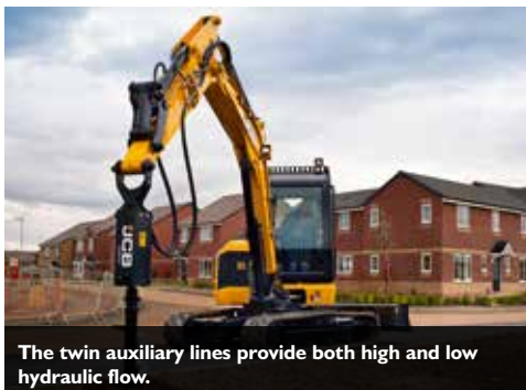
The twin auxiliary lines provide both high and low hydraulic flow.