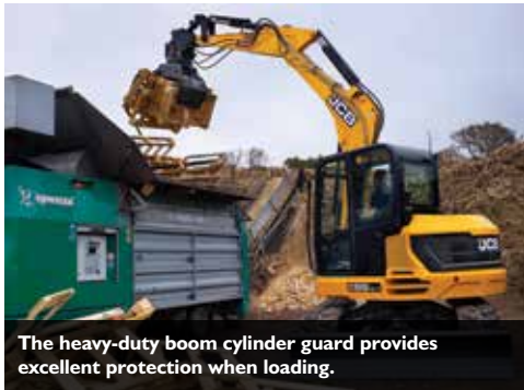
The heavy-duty boom cylinder guard provides excellent protection when loading.