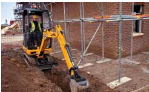
Controlled, precise and balanced operation of excavator functions.