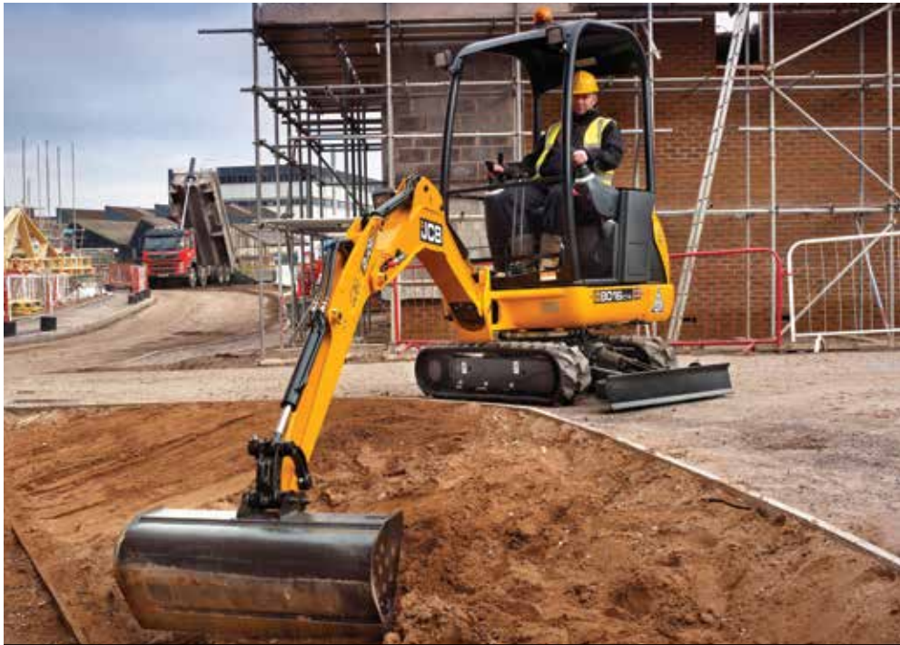
A solid, stable work platform improves productivity, versatility and operator confidence.

By improving the cab tilt angle by 17%, we've increased service access on an 8014/8016 CTS still further (it was already best-in-class). This design eliminates the need to work through restrictive floor hatches during servicing.