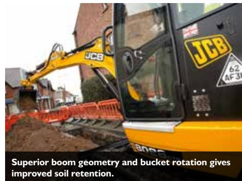
Superior boom geometry and bucket rotation gives improved soil retention.