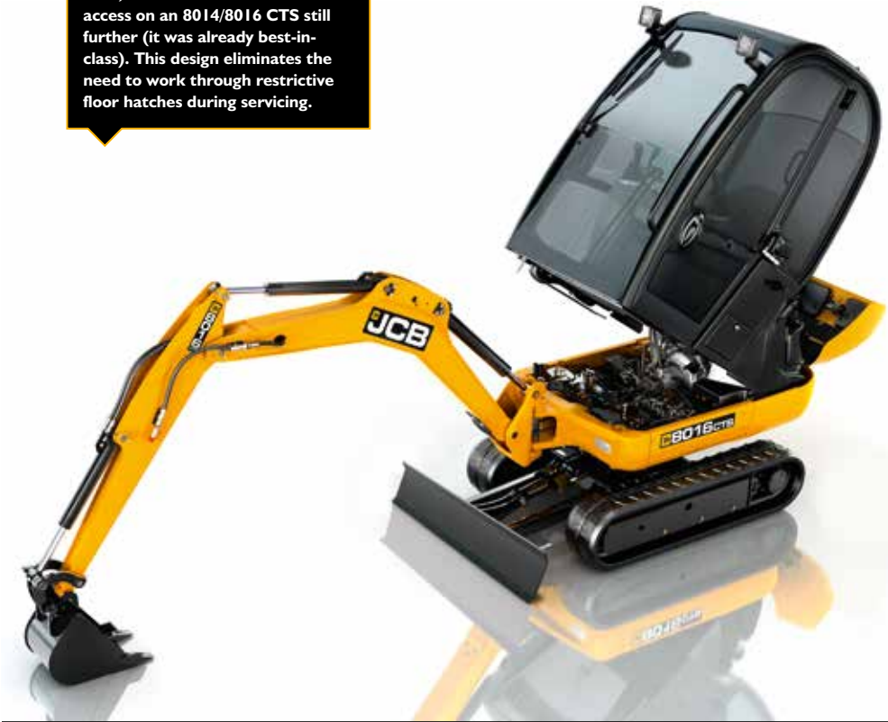
Wide-opening rear bonnet is supported by a gas strut for easy access to routine checks.