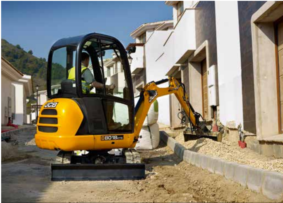
New dig-end geometry provides extra reach, load-over height, and dig depth.