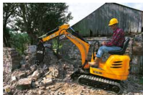
Huge range of attachments increases machine versatility.