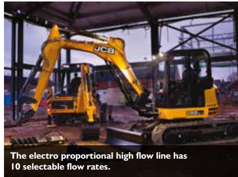
The electro proportional high flow line has 10 selectable flow rates.