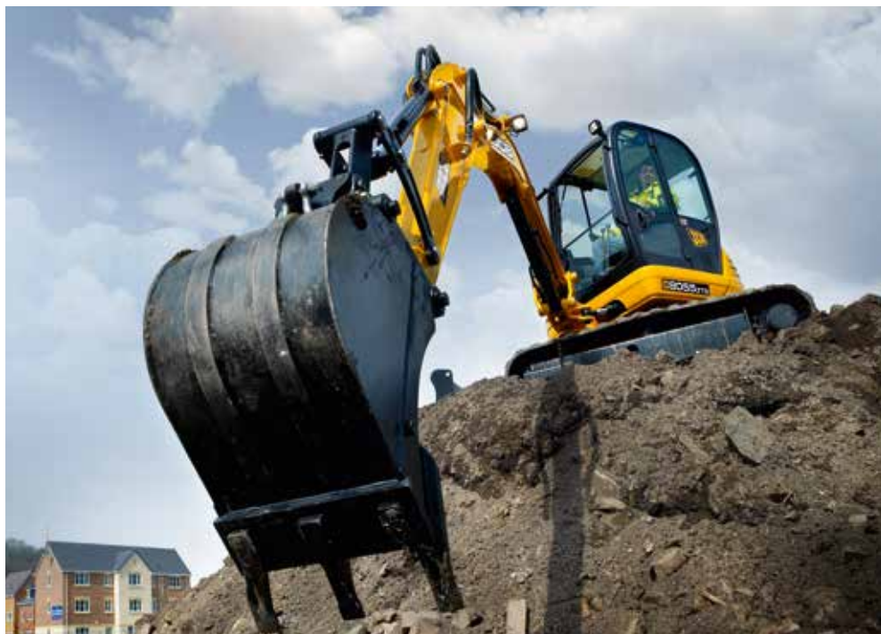
Impressive tearout forces and high levels of tractive effort and tracking speeds.