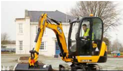
New hydraulic block valve allows you to travel in a straight line at the same time as selecting excavator functions, increasing productivity.