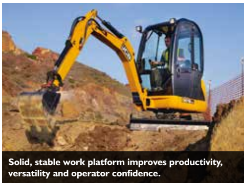
Solid, stable work platform improves productivity, versatility and operator confidence.