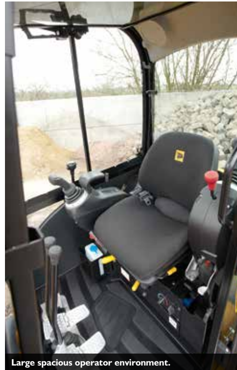
Large spacious operator environment.