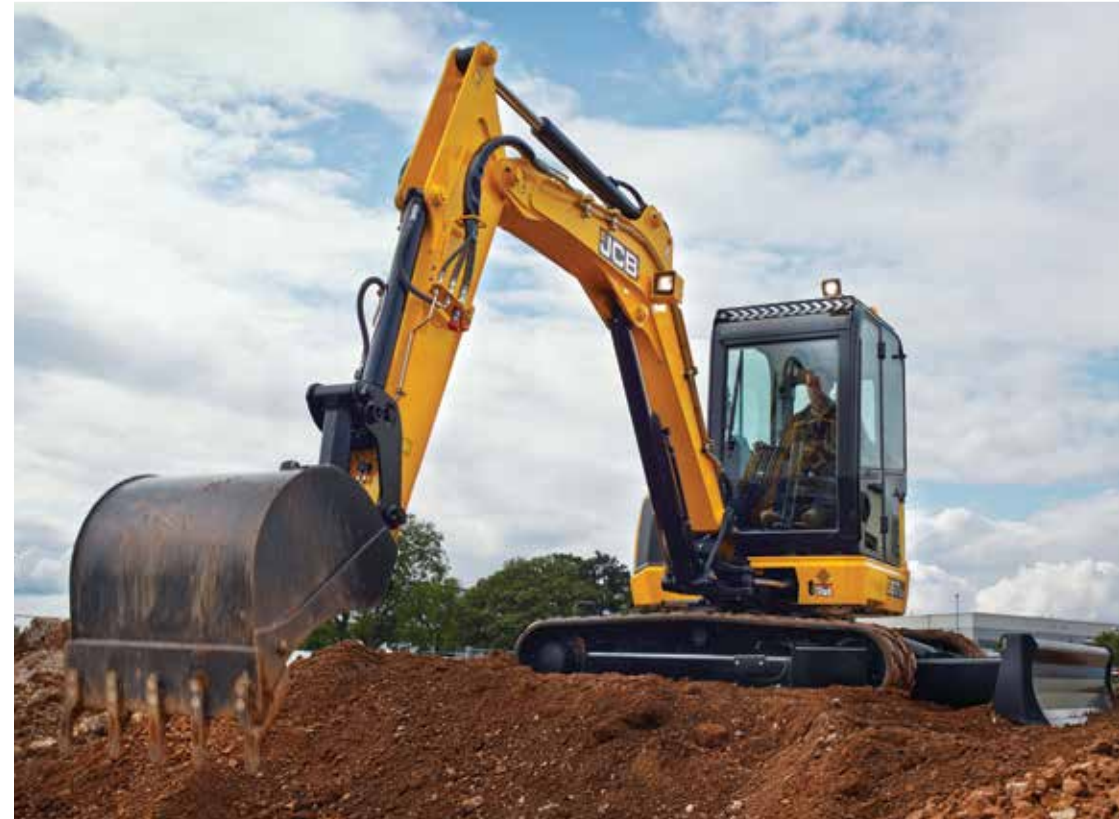
100% high strength pressed steel body work, no plastic.