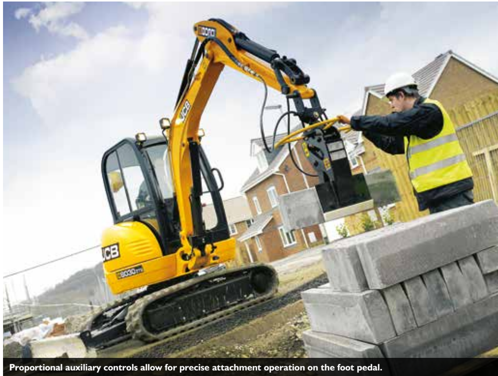
Proportional auxiliary controls allow for precise attachment operation on the foot pedal.