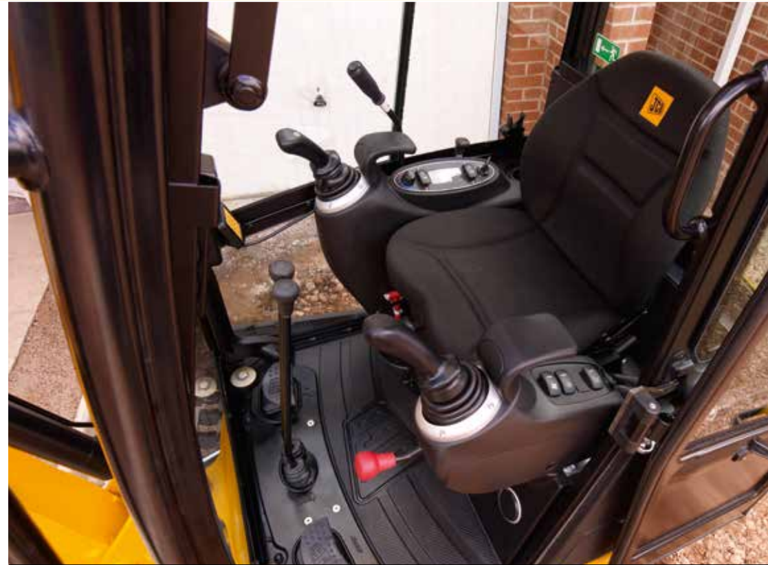
The cab is incredibly spacious and its large door provides easy, safe access.