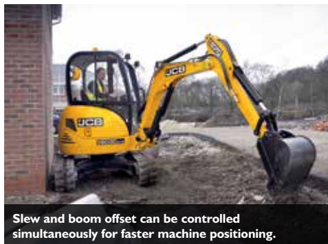
Slew and boom offset can be controlled simultaneously for faster machine positioning.