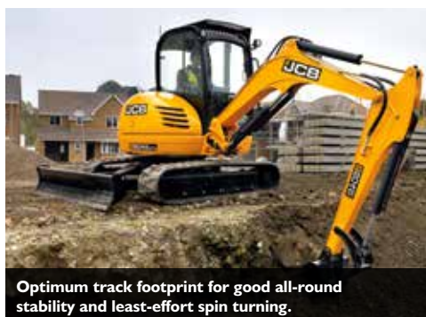
Optimum track footprint for good all-round stability and least-effort spin turning.