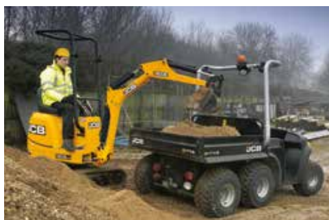
Excellent stability and lift capacity.