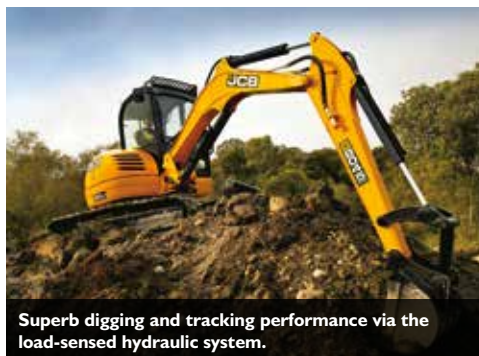
Superb digging and tracking performance via the load-sensed hydraulic system.

The JCB 8040 ZTS, 8045 ZTS and 8050 RTS/ZTS feature a 33kW engine, making these machines very powerful for this class of excavator.