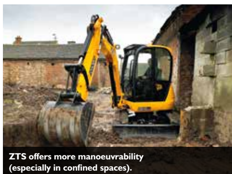
ZTS offers more manoeuvrability (especially in confined spaces).