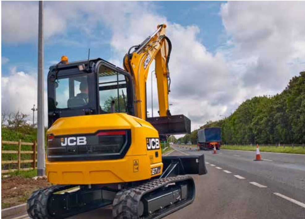
Tractive effort and 5kph tracking speeds are class-leading.