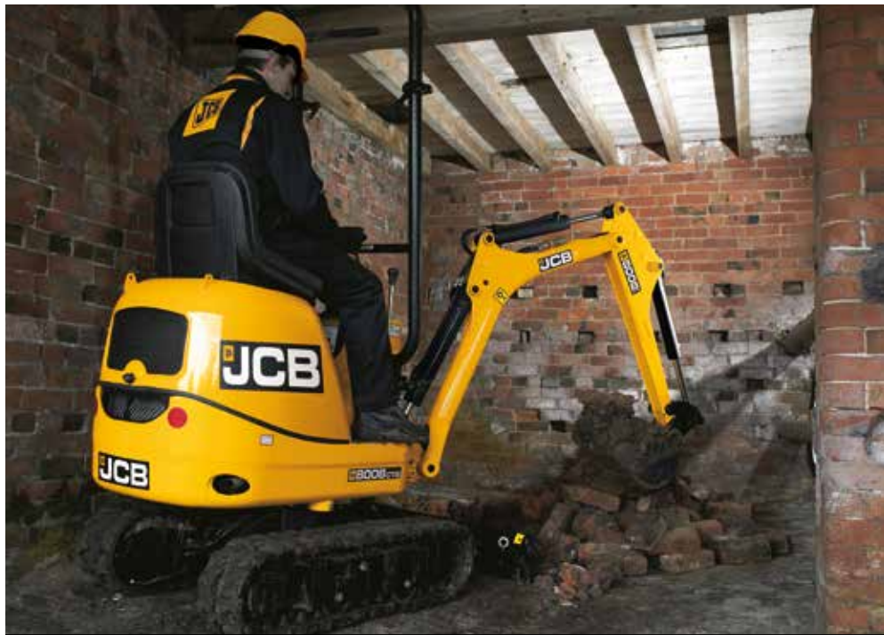
Compact size and minimal tailswing allows operation in confined areas.

The JCB 8008 CTS and the 8010 CTS have the ability to track through a standard 2' 6" (762mm) doorway, bringing difficult-to-access areas well within reach. You can take them inside or through buildings, and into restricted access rear gardens. And thanks to the optional folding safety frame, even height restrictions present no problem.