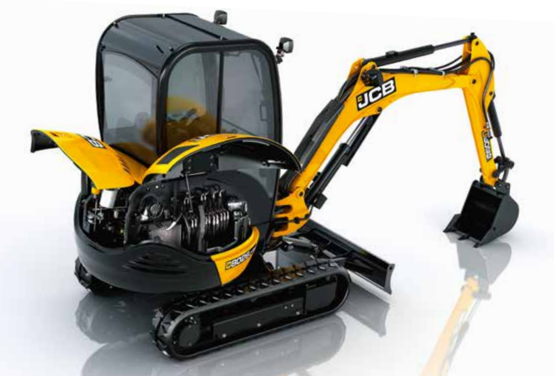
Pin end greasing makes lubricating the dig end quick and easy. While wide-opening service access panels are supported with gas struts for excellent access to routine checks.