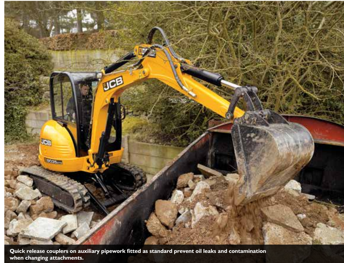
Quick release couplers on auxiliary pipework fitted as standard prevent oil leaks and contamination when changing attachments.