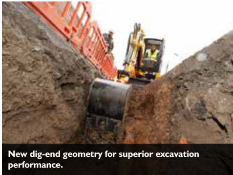
New dig-end geometry for superior excavation performance.