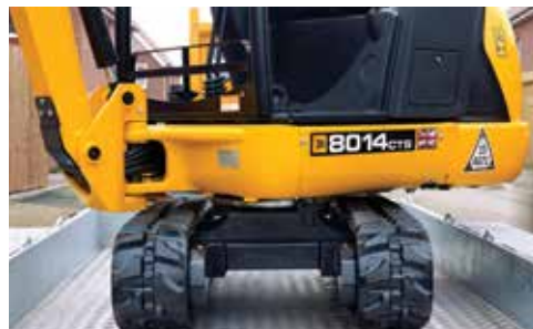
Easily towed to wherever you need it.