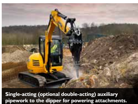
Single-acting (optional double-acting) auxiliary pipework to the dipper for powering attachments.