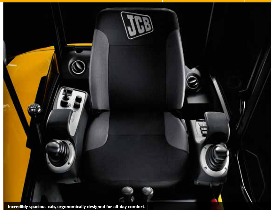
Incredibly spacious cab, ergonomically designed for all-day comfort.