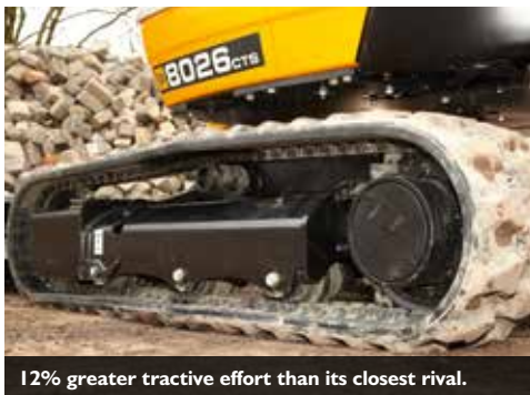
12% greater tractive effort than its closest rival.