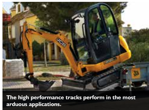
The high performance tracks perform in the most arduous applications.