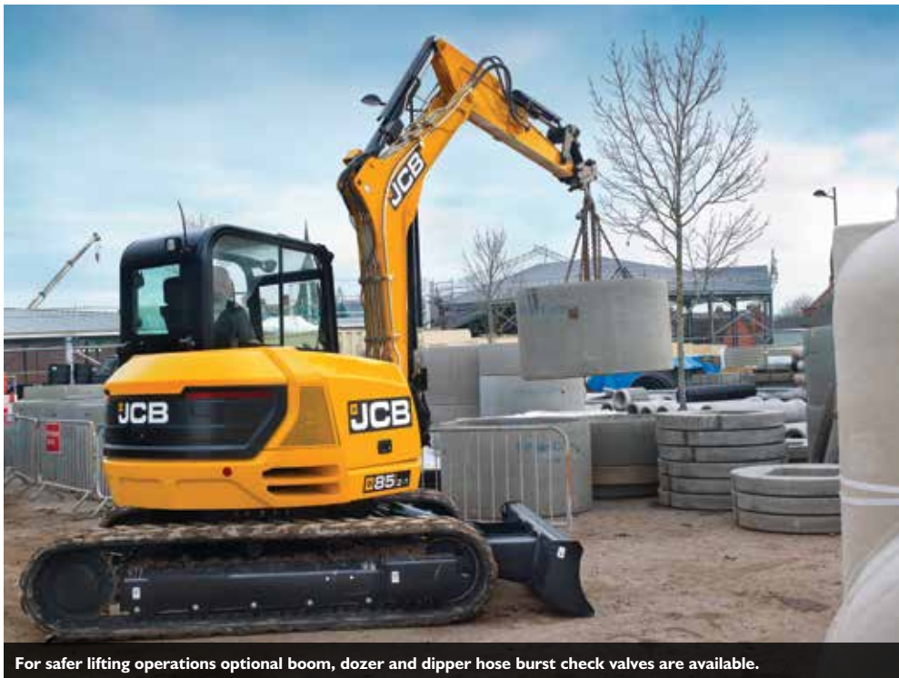
For safer lifting operations optional boom, dozer and dipper hose burst check valves are available.